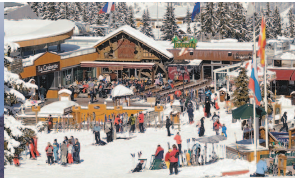
IN THE THICK OF IT La Croisette in Courchevel 1850 – the hub of the resort.