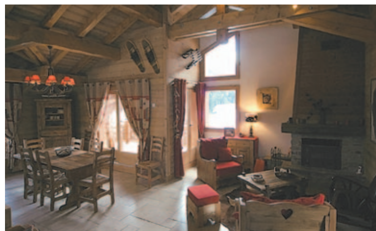
LUXURY BASE Ski Power's stunning catered Chalet Sylvie in Courchevel 1550 – Francesca's fantastic home for the week.

Our accommodation for the week was Ski Power's luxurious Chalet Sylvie, just a stone's throw from the gondola providing direct